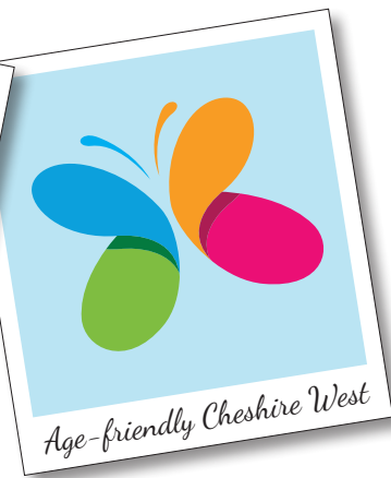
Age-friendly Cheshire West

The butterfly is a symbol of change and transformation. It forms part of the identity for Age-friendly Cheshire West and has become synonymous with Brightlife, a local 5-year, project funded by The National Lottery Community Fund. Brightlife aims to help find ways of reducing social isolation and loneliness and is due to end in March 2020.