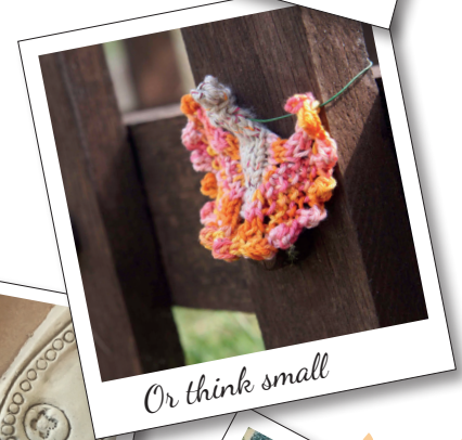
Or think small