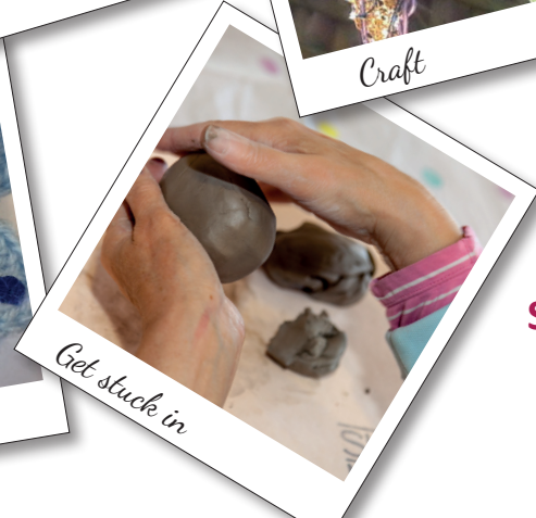
Get stuck in